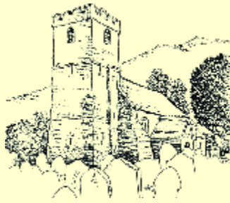
St Clydawg's Clodock