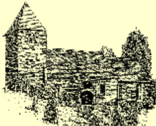
St Michael's Michaelchurch Escley