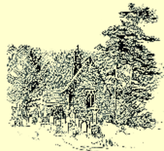
St Peter & St Beuno Llanveynoe

The Parishes of Clodock & Longtown with Craswall, Llanveynoe, St Margaret's, Michaelchurch Escley & Newton