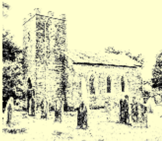
St John's Newton