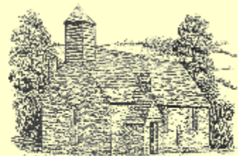
St Mary's Craswall