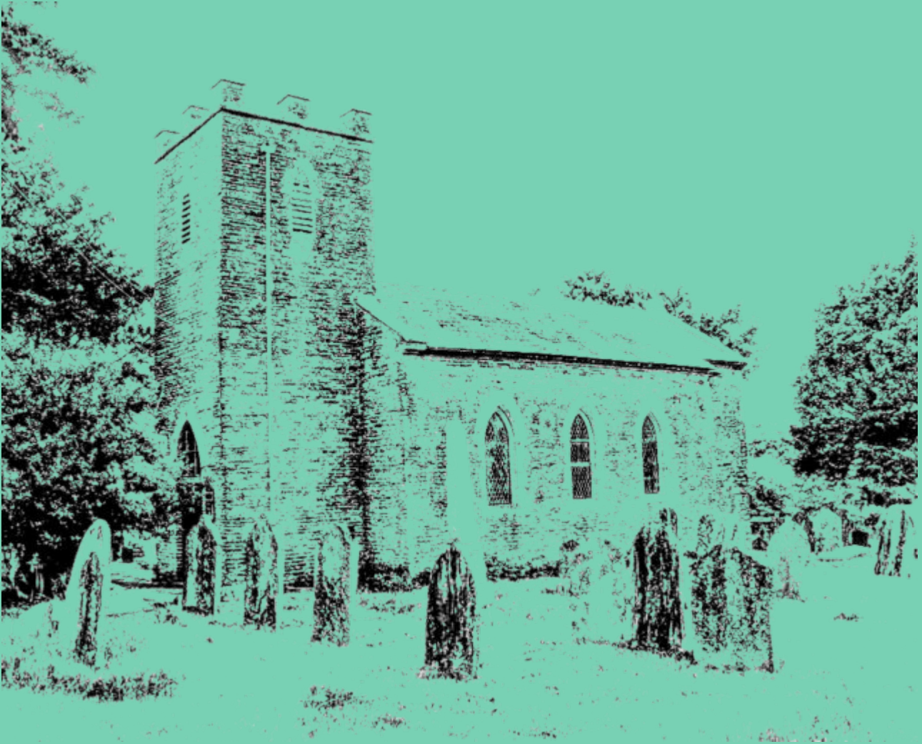
St John's, Newton

The Parishes of Clodock & Longtown with Craswall, Llanveynoe, St Margaret's, Michaelchurch Escley & Newton